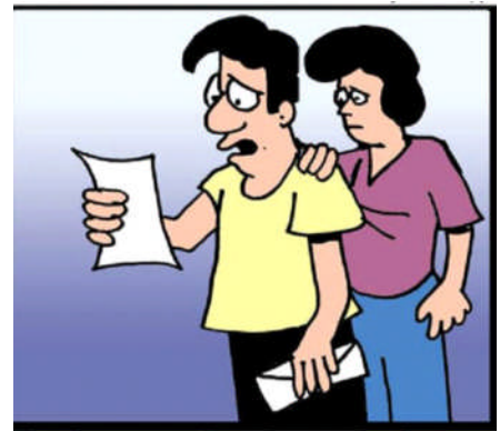
"Its from our church... we've been called up for active duty."

A recent survey by LifeWay Research reveals that 61% of church members are not sharing their faith. Not sharing as in never, ever, ever. Many church leaders believe that the number of people who do not share their faith is higher than the research states. Whatever the percentage is, the undeniable truth is that an overwhelming number of church members are not engaged in the church's mission. The church is often compared to an army. In the well known hymn "Onward Christian Soldiers", we sing "like a mighty army moves the church of God" but is the church today, is our congregation moving like an army actively involved in spreading the Gospel of Christ with others? All too often I think we view our part as being in the reserves, serving part time and the rest of our time is our own rather than being on active duty serving God full time. Every believer is on active duty, called to energetically take part in fulfilling the Great Commission (Matthew 28:19, 20).